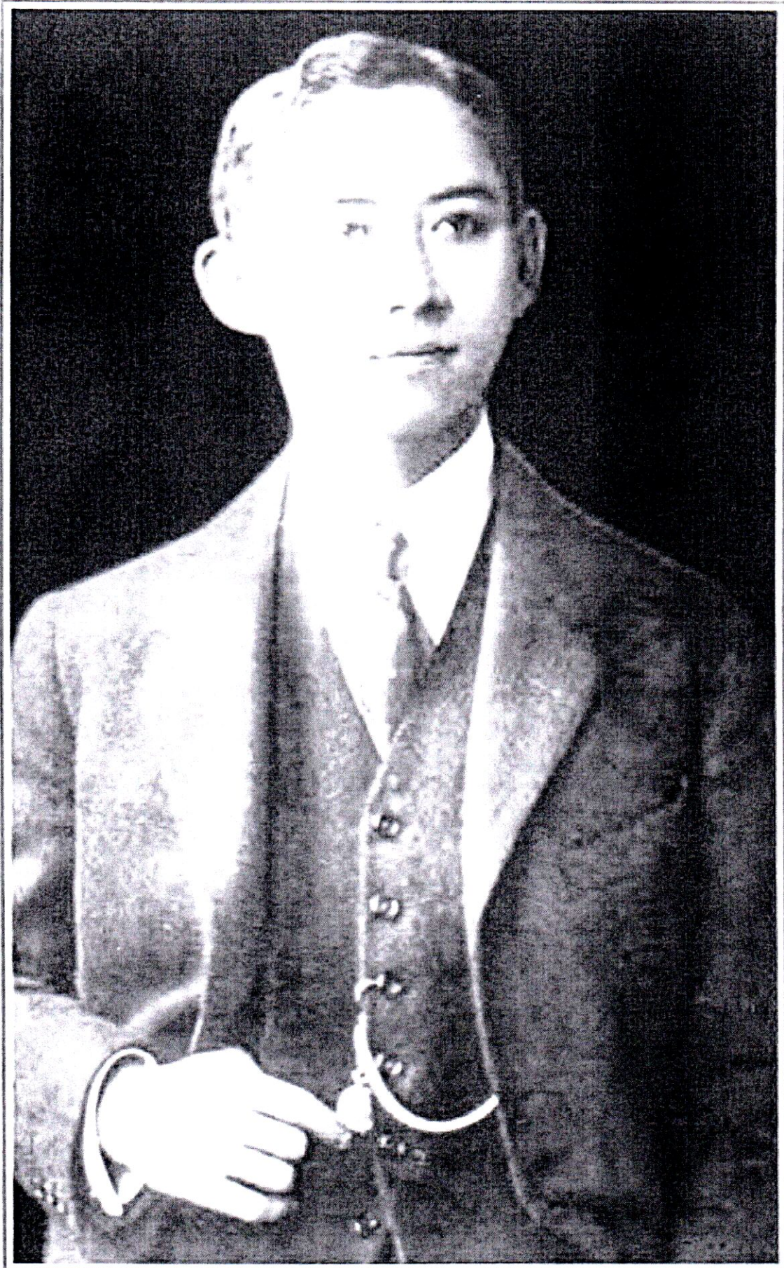
H.R.H. Prince Mahidol of Songkla